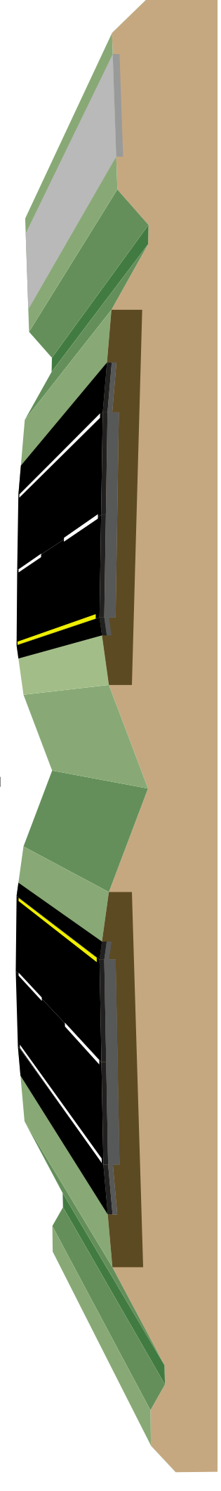
RURAL CONTROLLED ACCESS ARTERIAL TYPICAL SECTION